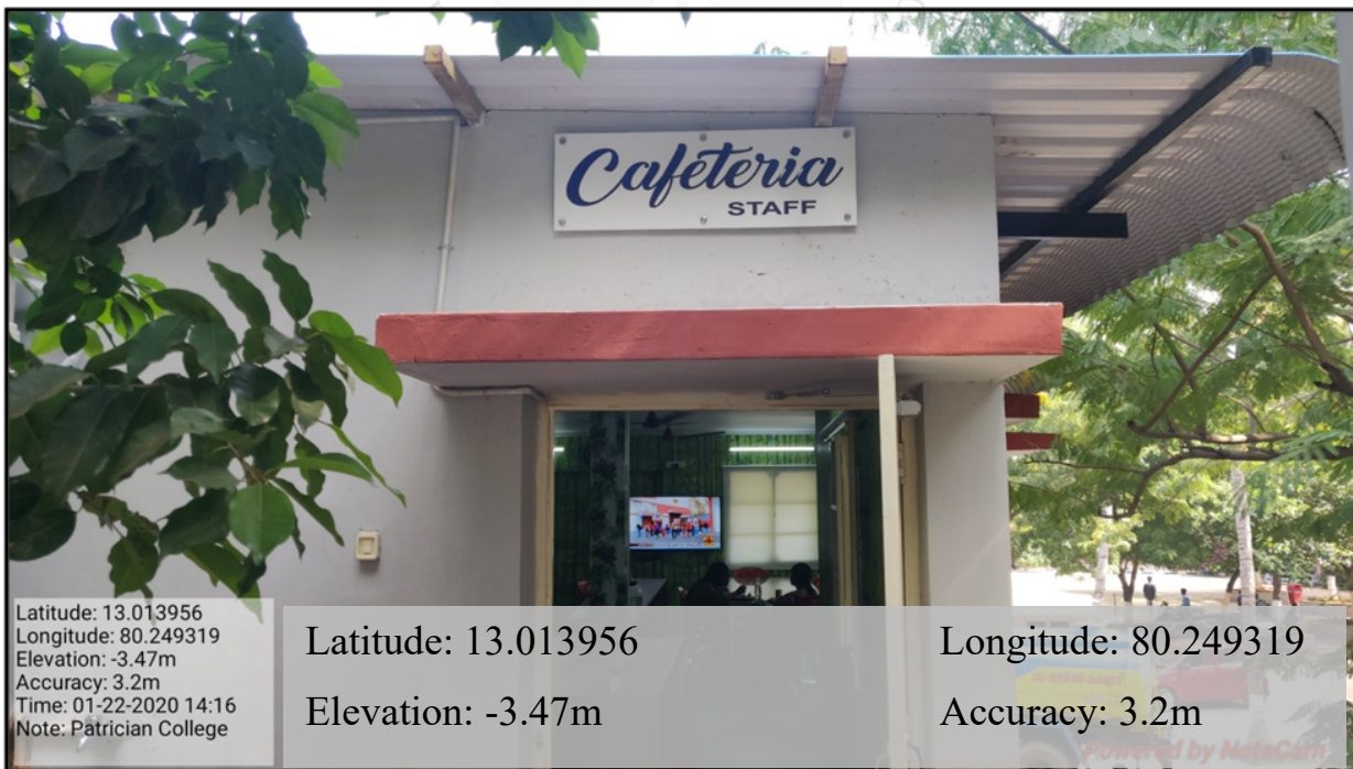
Staff Common Room/Cafeteria