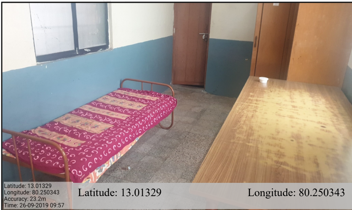
Sick Room for Students