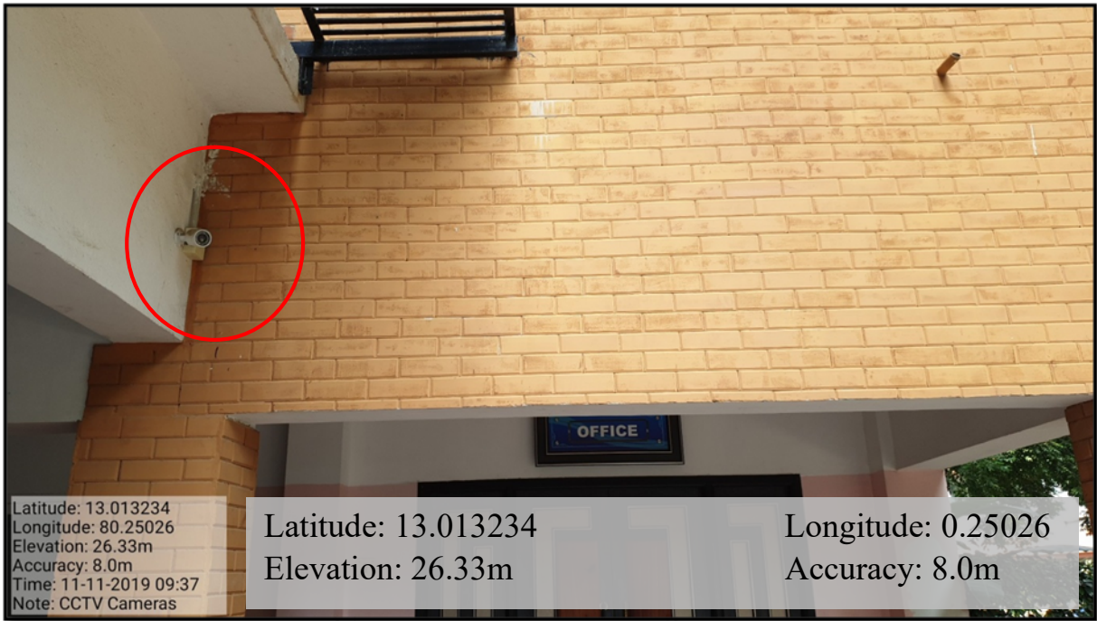
CCTV Cameras Installed in the College Campus