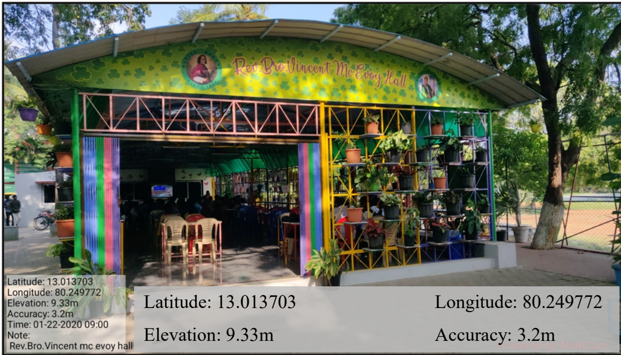
Student’s Common Room/Cafeteria